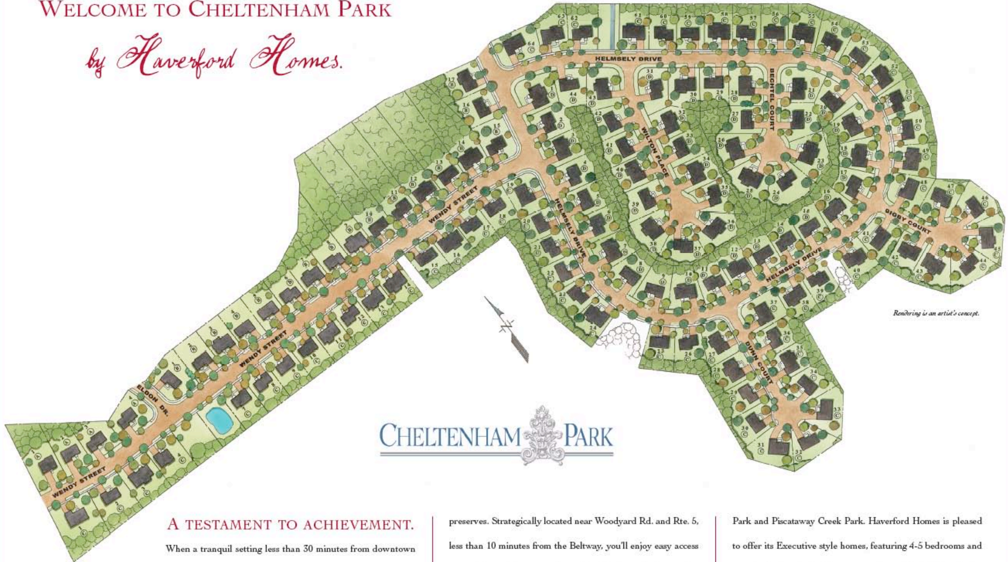
Rendering is an artist's concept.